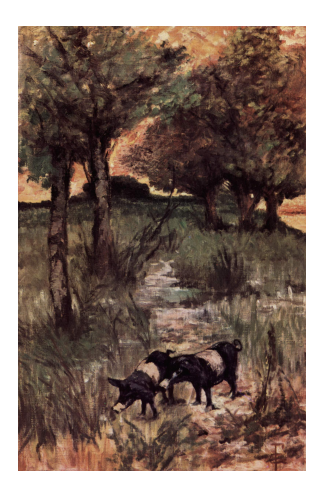
Figure 2. Livestock roamed freely in colonial North Carolina, and it was a farmer's responsibility to fence them out.

The question of whether natural resources could be privately owned applied not only to land, but to animals. Colonists allowed livestock such as pigs to roam freely, then rounded them up in fall and winter months for slaughter. By 1700 in England, laws required farmers to keep their livestock securely penned so that they wouldn't damage crops. But in North Carolina — and throughout the South until the late 1800s — the opposite was true. Livestock could range freely, and it was a farmer's responsibility to fence in his crops and to fence out other people's animals!<sup>6</sup>