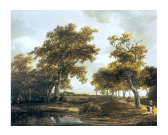
Figure 1. What does this seventeenth-century painting tell us about the way Europeans thought about how land should be owned and managed?

When they purchased land from Indians, Europeans understood the deal as a full transfer of rights. A man who purchased a tract of land was understood to have the right to use it for any purpose, sell it to whom he wished, and to forbid trespassers. Indians, by