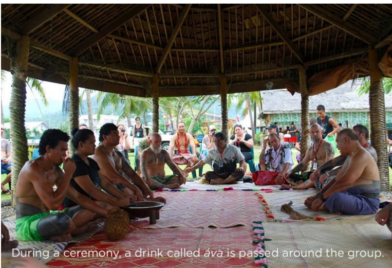
During a ceremony, a drink called áva is passed around the group.