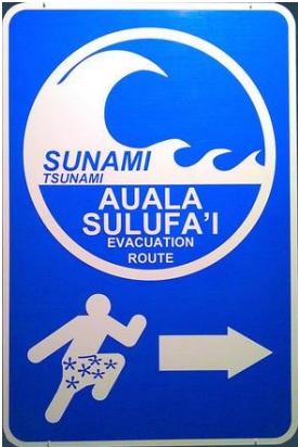
Tsunami evacuation sign

When the shaking stopped, people noticed the sea was rough and bubbly. Then it drained rapidly away from the shore. Within minutes, a tsunami swept over the islands. In some places, its height reached around 40 feet (12 meters). The earthquake had triggered the tsunami.